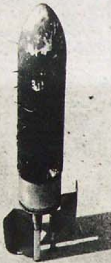
1 Foot 'CS' Shell

Stockholm: July 4, 1969 The American Deserters Committee