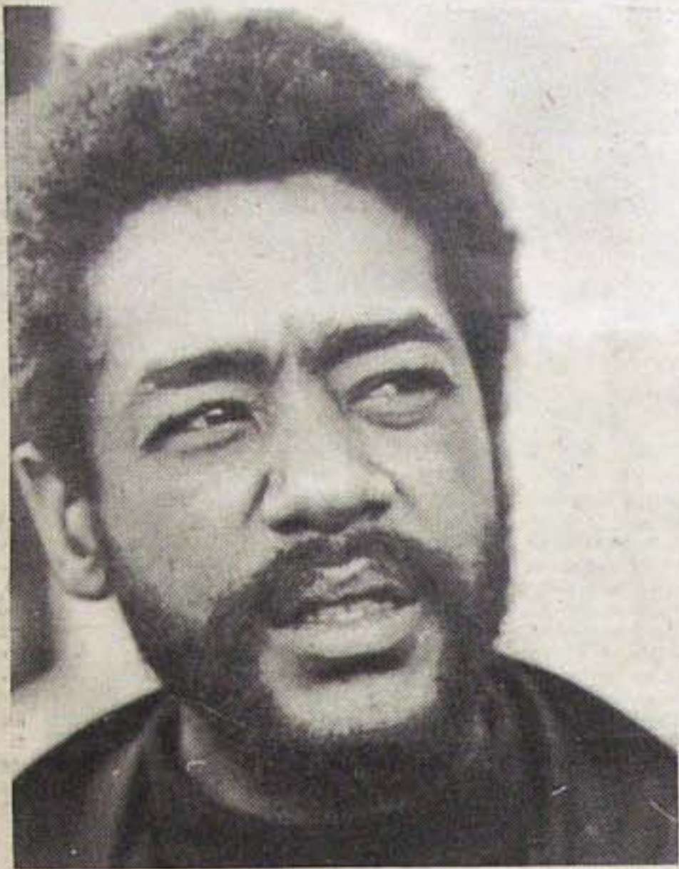
BOBBY SEALE, CHAIRMAN, B.P.P.

This is the county jail, city prison, San Francisco, California. And this is Bobby Seale, the Chairman of the Black Panther Party of which Huey P. Newton is the Minister of Defense, and Eldridge Cleaver is the Minister of Information. I am presently incarcerated here as a political prisoner in the same manner that our Minister of Defense, Huey P. Newton, is incarcerated in another prison here in California known as C.M.C. (south of San Francisco 200 miles). And I wanted to send a message from jail here as a political prisoner.