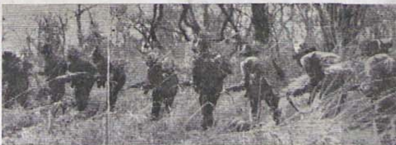
Africa is headed for many "Vietnams"