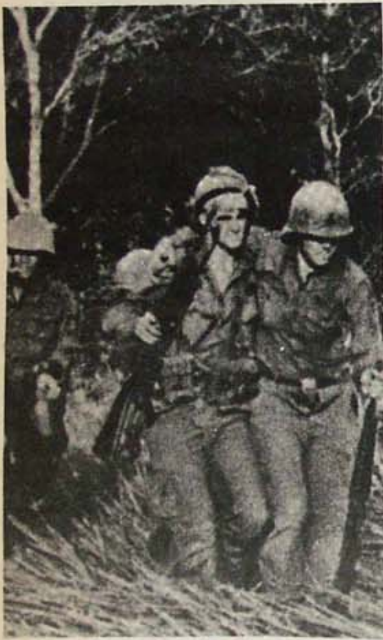
Glory for the Pentagon