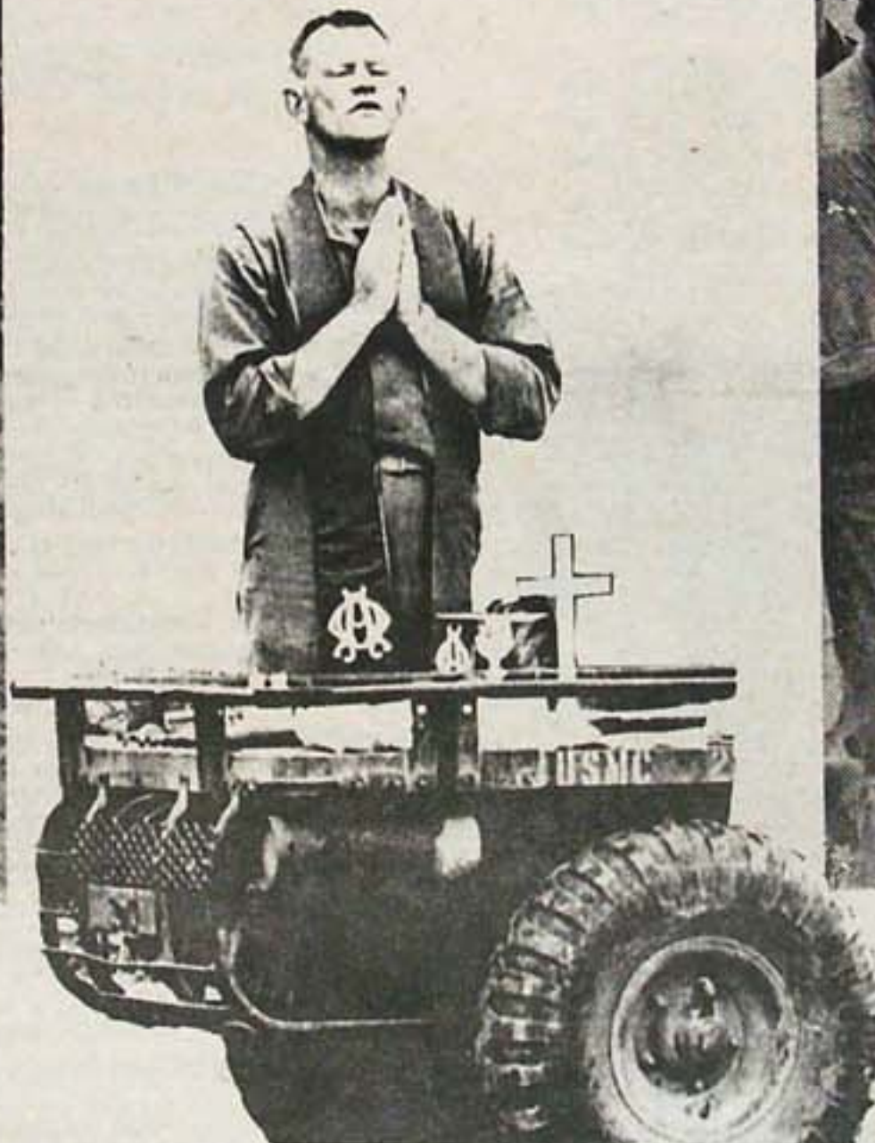
Holy Water to Sprinkle on Hydrogen Bombs