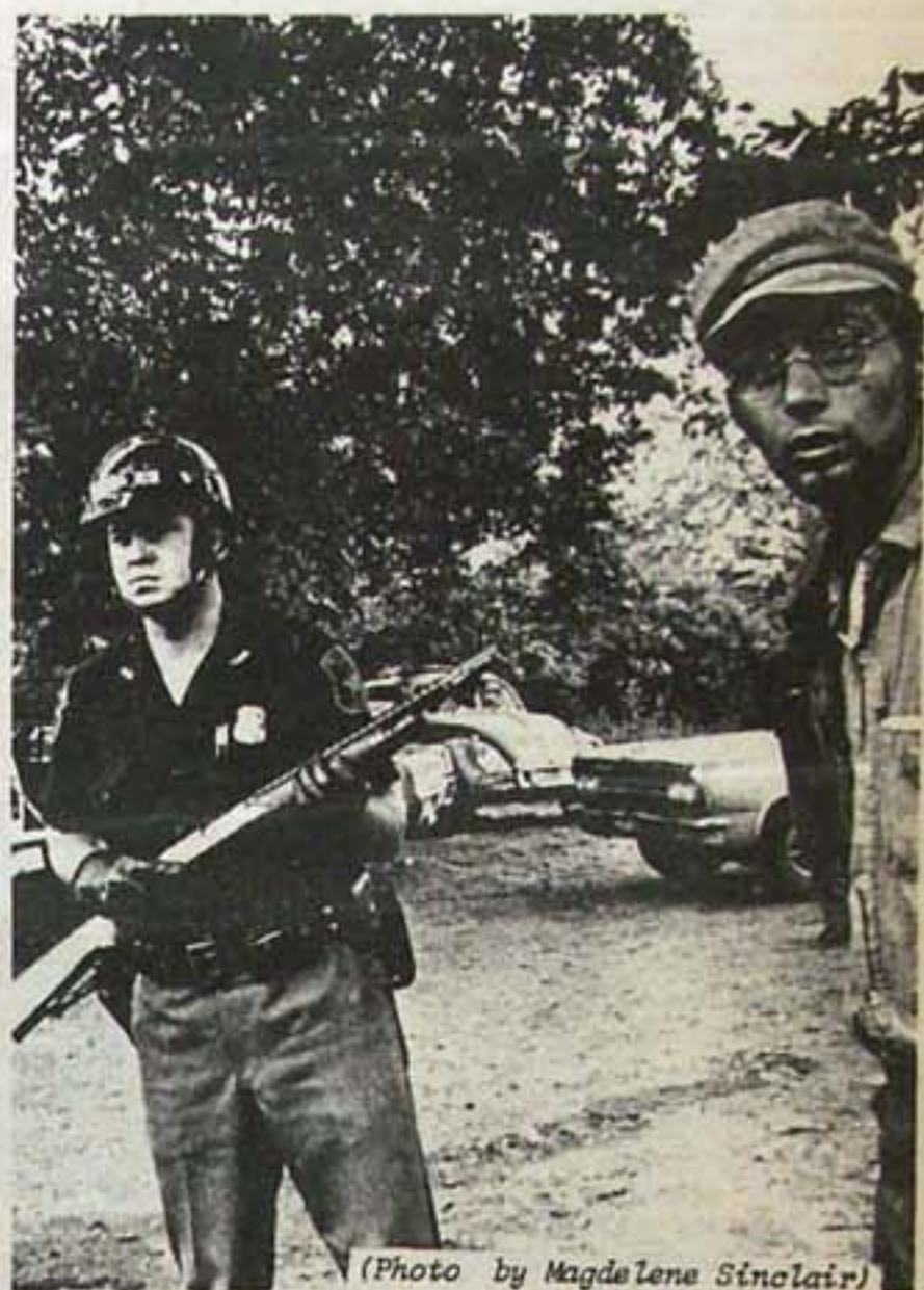
Porky Pig Guards Dangerous Hippy

STRAIGHT: Have you ever been busted for any-