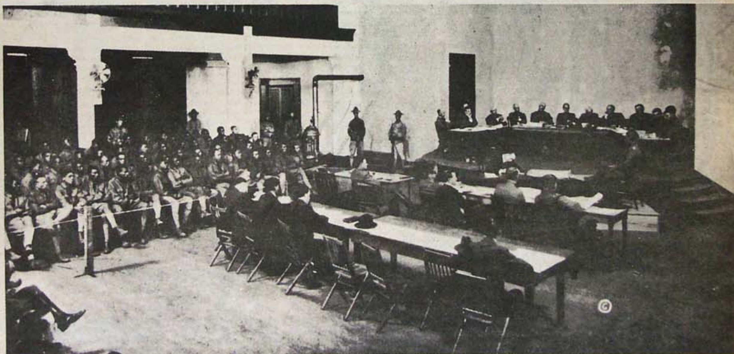
Gift Chapel, Fort Sam Houston, Texas.

chemical which supposedly acts like tear gas. Biologist Matthew Meselson, calculating from figures in an Army field manual, reports that between 1964 and 1969 the Army purchased 13,736,000 pounds of CS, CS-1, and CS-2 for use in South-