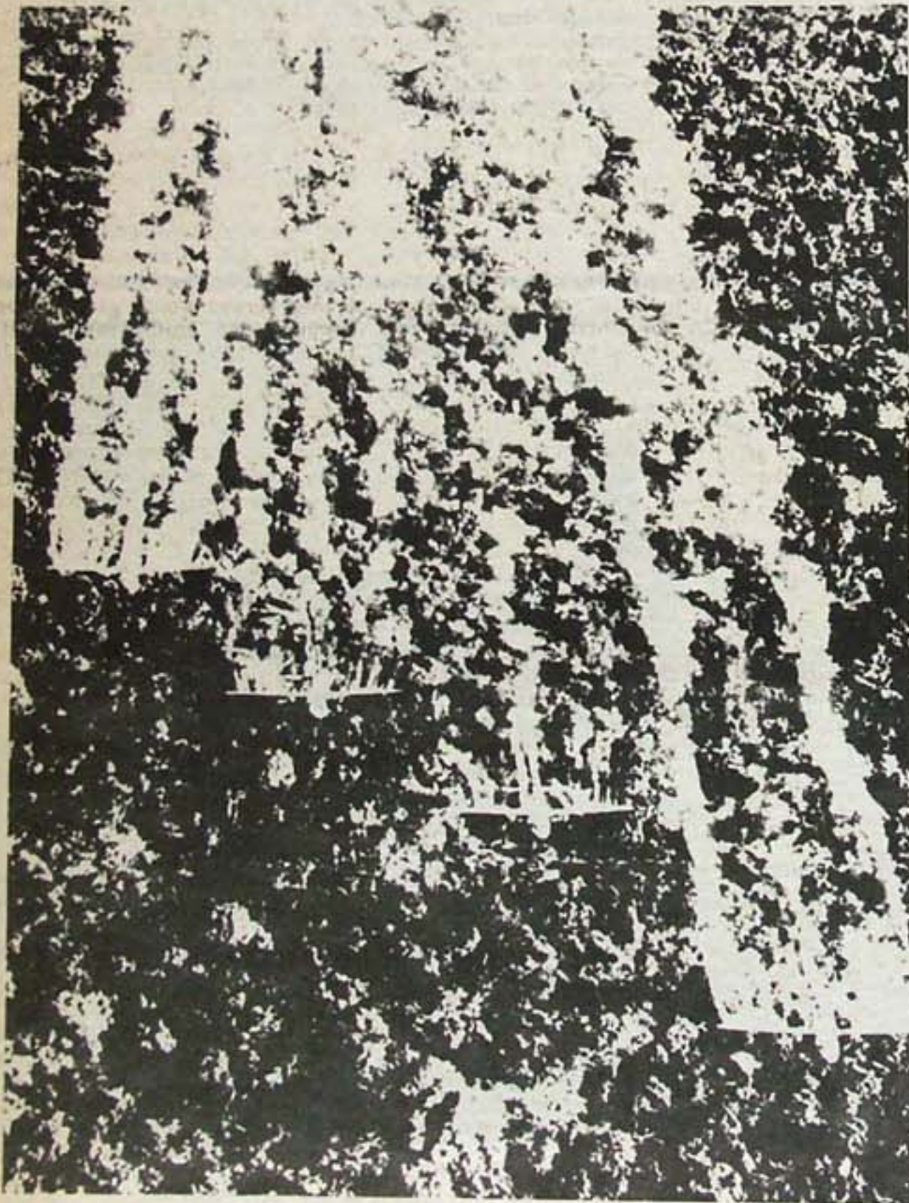
U.S. Aircraft Spray Toxic Chemicals on Vietnam jungles

In the only official data on target accuracy available to me the Air Force admits half the supposed tar-