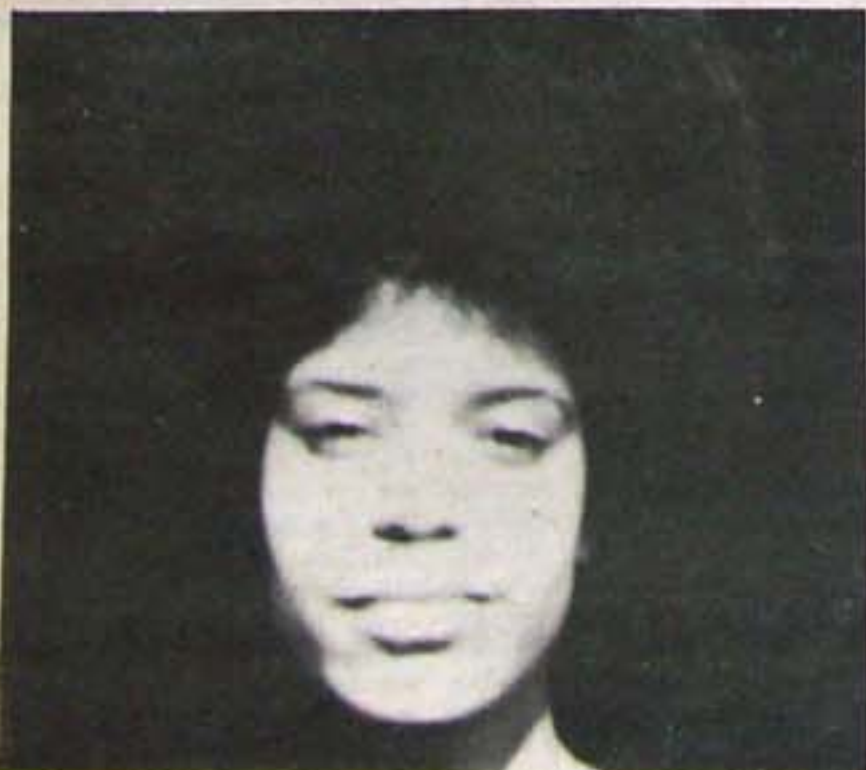
The San Diego Branch of the Black Panther Party has exposed a foul element within our ranks.