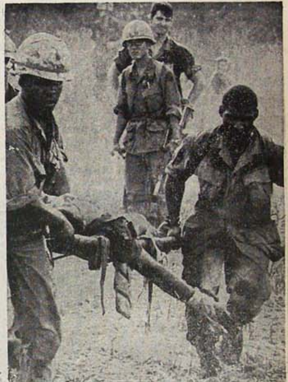
Profit for the Capitalists

blast had his lower right arm blown off, was hit by 33 fragments in his other arm, and was burned over 60% of his body. Men burned over a large portion of their bodies seldom survived in former wars. This was not usually a result of the burn itself but of the onset of lethal bacteria known as Pseudomonas . Thanks to wonder drugs such as Sulfamylon, however, the number of deaths as a result of this infection is greatly reduced.